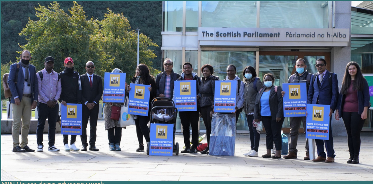
MIN Voices doing advocacy work

This interactive workshop, led by members from the MIN Voices group, will explore challenging the hostile environment with the impacted community as the values and rights of the people are at constant danger. It will provide the opportunity for the members of the MIN Voices group to present the recent achievements highlighting the importance of creating spaces of hope using creativity. Looking at the Right to Work - Lift the Ban campaign. There will be space for the participants to create banners, messages and posters highlighting methods of creating hope.