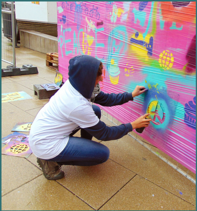
The Spray Peace team at work

On Friday, there will be the opportunity to try your hand at spray painting during an interactive workshop in the garden of Heart of Scotstoun.