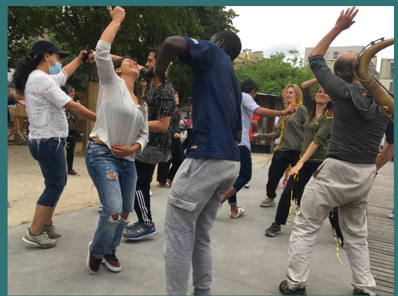
Dancing with Les P'tits Déjs Solidaires

The Paris Free Breakfast Movement known as the P'tits Déjs Solidaires works to the motto II faut que ça tourne, or 'everyone has to keep moving', that is, around the table and in the broader organisation, changing roles, adapting to newcomers. All the people joining the session for the Spring School are regular participants in the making of jam tartines and chocolate pieces while playing a variety of other roles, including accompanying individuals, writing creatively and combatively, facilitating drawing workshops, joining in dance events.